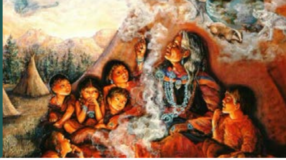
Hopi art by Josephine Wall